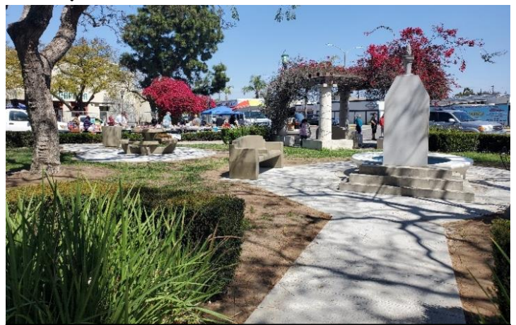
New Park Amenities installed at the Kennedy Park located on Marcelina and Cabrillo Avenues.

A permanent outdoor dining program was approved by the City Council on March 14, 2023.