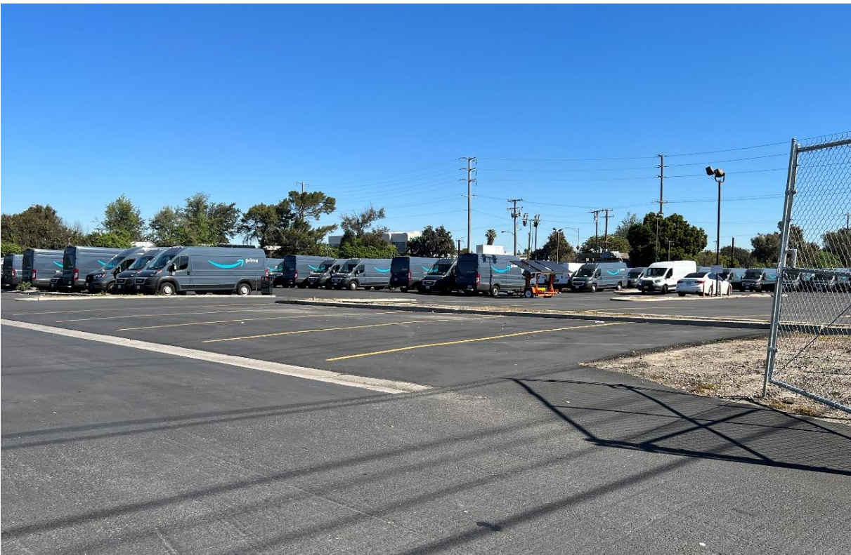
Photo 2: View of project site looking northeast from 190 th Street.