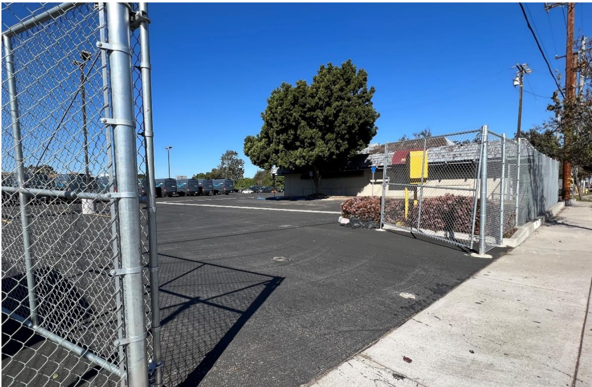
Photo 4: View of project site looking northwest from Western Avenue.