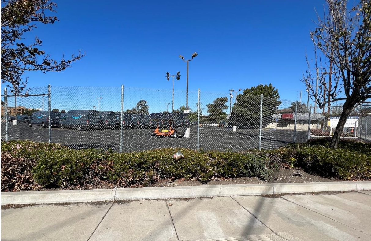
Photo 3: View of project site looking northwest from 190 th Street and Western Avenue intersection.