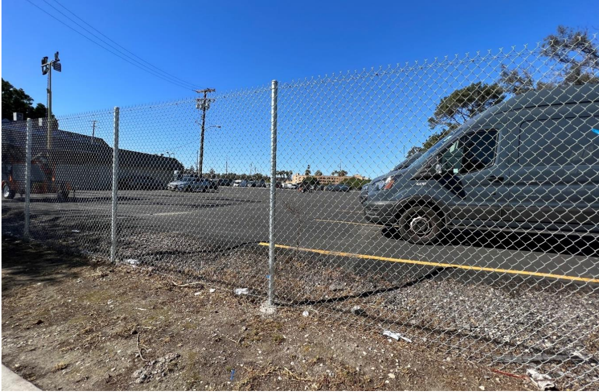
Photo 5: View of project site looking southwest from the northeastern corner of project site on Western Avenue.