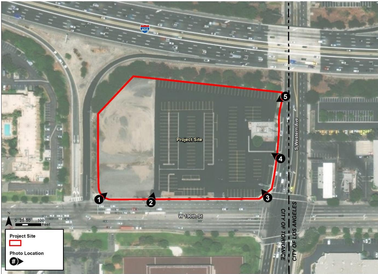
Locations where photos of the project site were taken.