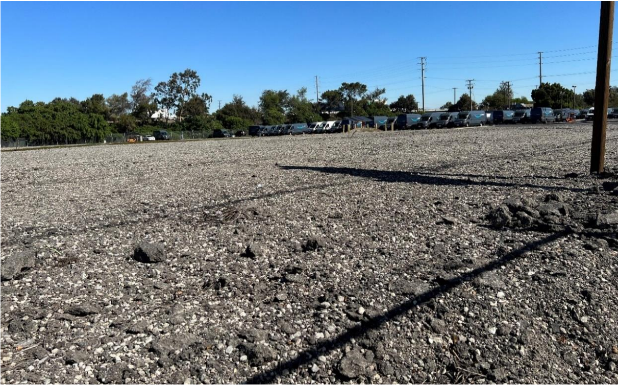
Photo 1: View of project site looking northwest from the southwestern corner of project site on 190 th Street.