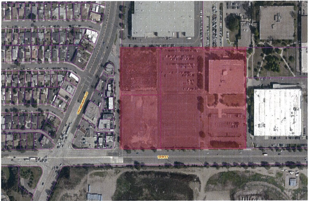
City of Torrance GIS Aerial Imagery (circa 2019) of proposed project placement (red) and surrounding uses.

Lead Agency: City of Torrance 3031 Torrance Blvd. Torrance, CA 90503