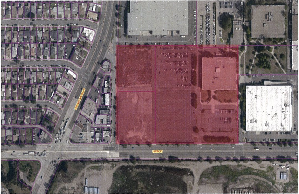
City of Torrance GIS Aerial Imagery (circa 2019) of proposed project placement (red) and surrounding uses.

Lead Agency: City of Torrance 3031 Torrance Blvd. Torrance, CA 90503