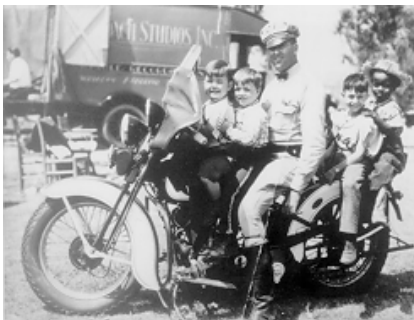
"Our Gang" stars, filming in Torrance, pose on TPD motorcycle