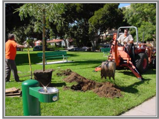
City of Torrance Streetscape staff digging hole for new tree.

For any comments or questions, contact the City of Torrance Redevelopment Agency Staff at 310.618.5990.