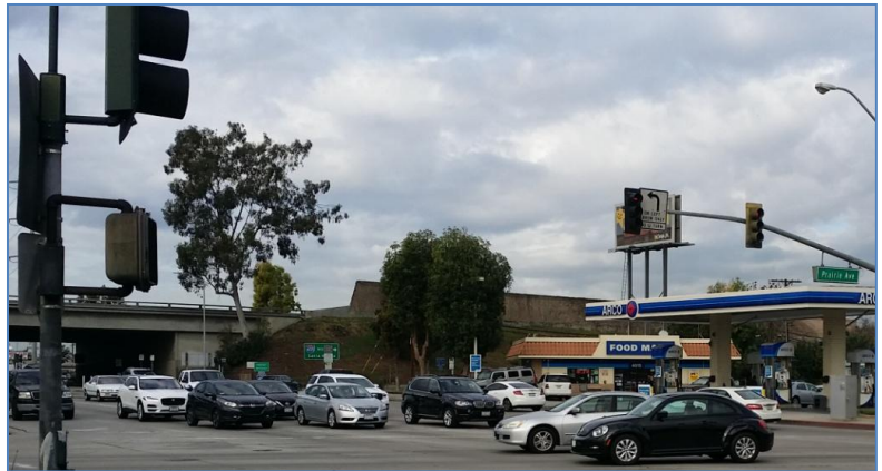
(Prairie Avenue / Redondo Beach Boulevard)

On Thursday, February 15, 2018, the Torrance Police Department will conduct their 3 rd HVE operation at the intersections of Prairie Avenue and Redondo Beach Boulevard and Crenshaw Boulevard and Artesia Boulevard. Traffic Sign Boards reminding drivers to obey traffic laws will be placed at both intersections. Several motor officers will also be present to devote the majority of their time to educating the community. Officials will be focusing on " JAYWALKING ", a primary concern for injury collisions in those areas.