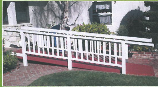
Disability upgrades and customized wheel chair ramps.