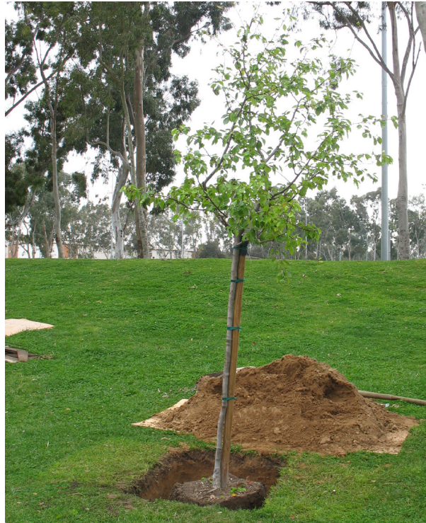
Front cover: Liquid Amber Tree, Above: Bradford Pear Tree

Creating and Enriching Community Through People, Programs and Partnerships