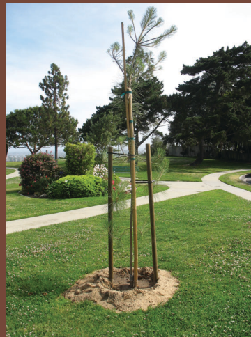
Canary Island Pine Tree