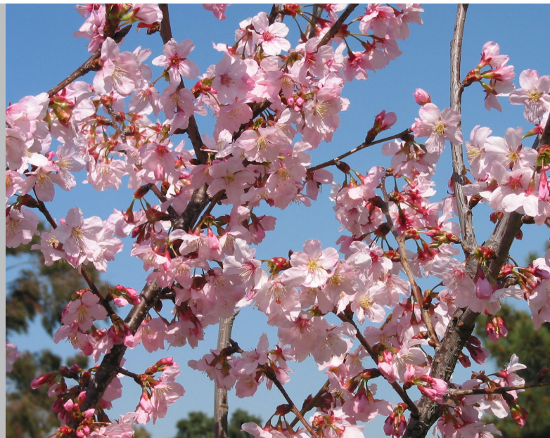
Flowering Cherry Tree

The City of Torrance, through the Community Services Department's "Living Dedication" Tree Program, offers an exciting, meaningful and unique way to contribute to your community... a gift that will give others genuine enjoyment for years to come.